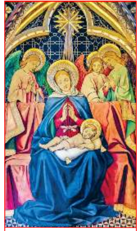
The Nativity scene from the All Saints' Reredos Available as Christmas cards — £5 per pack of six, sold in aid of All Saints.

At All Saints we are a family that sings and tells stories together. This month we