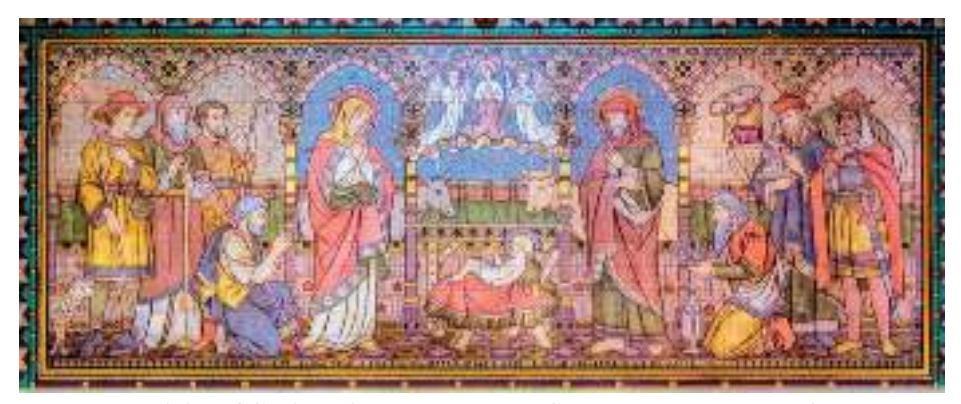
The Nativity of Christ, with Mary, Joseph, Shepherds and the Magi from the All Saints' tile panelling Available as Christmas cards — £5 per pack of six, sold in aid of All Saints.